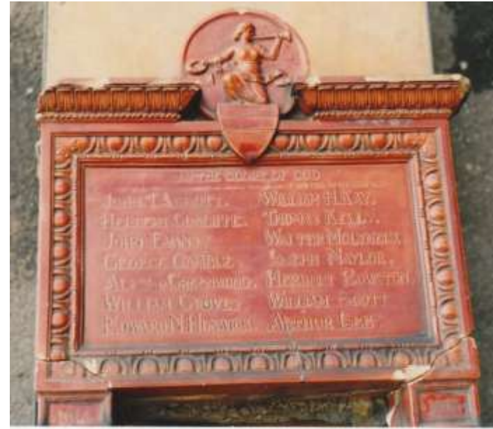
Plaque commémorative apposée à la brasserie